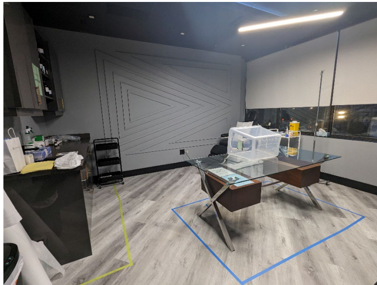
Figure 1. Clinic room. For the purposes of the exam, the area marked with green tape will represent the anteroom, and the area marked with blue tape will represent the buffer room.

You will complete both the sterile compounding and vascular access practical exams within a clinic room. The clinic room will be set up with a patient bed, counter with sterile compounding supplies, table with the mock laminar airflow hood, and a trolley with vascular access supplies.